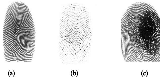
Figure 3: (a) A good quality fingerprint image, (b) A poor quality fingerprint, and (c) a noisy fingerprint image.