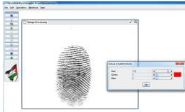
Fig 5:Sample result of Classification

To test the proposed approach, two databases are used one was collected from the hospital that is used for testing(DB1 And DB2)and another database contains the three images (obliteration,distortion and immmitations). DB1 database contains 4000 images that are classified using the FSDCA algorithm.