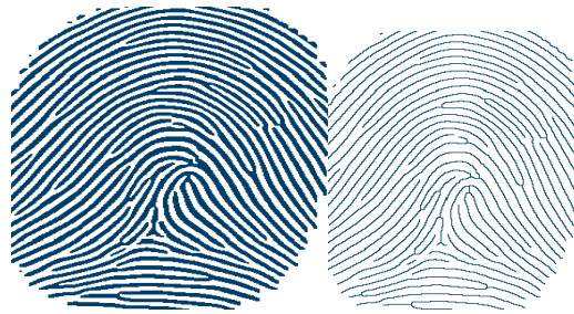
Figure 4: (a) Fingerprint ridge thinning, (b) Enhanced thinning,

Step 5: Repeat steps 1 – 4 until whole of the image is scanned and the erroneous pixels are removed.