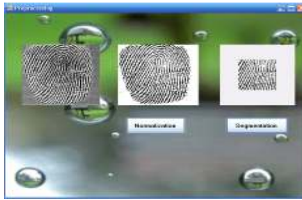
Fig 5: Result of Pre-processing