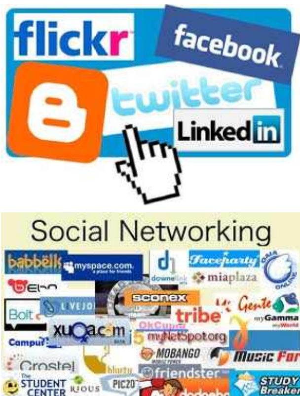
Fig. 2: Various Social Networking Sites