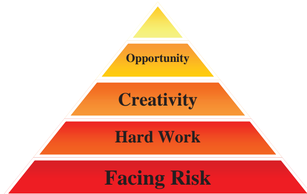
Figure 1: Factors Associated with Entrepreneurship

Entrepreneurship is a process of creating some thing of a value for public consumption. Before coming to function an entrepreneurial venture has to contend with and counter financial physiological and social risks. The result is a rich monetary reward and a sense of personal achievement for the entrepreneur. There is a conscious or unconscious awareness of need based products in people's mind and when their requirements are fulfilled by an investor it becomes service to them which justifiably carries its own reward. Some of the factors associated with entrepreneurship are dealt as shown in Figure 1.