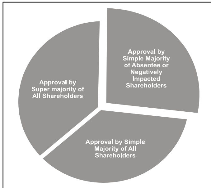
Exhibit IV Circumscribing Controlling Shareholders’ Dominance over Key Corporate Decisions A Suggested Voting Rights Model (Slicing not to scale)

a simple majority but some would require a super-majority of 75% plus as currently required. The third segment would comprise interested party resolutions where only the absentee shareholders will have the right to vote. Exhibit IV depicts a stylized graphic (not to scale) of the likely voting profile when this recommendation is implemented.