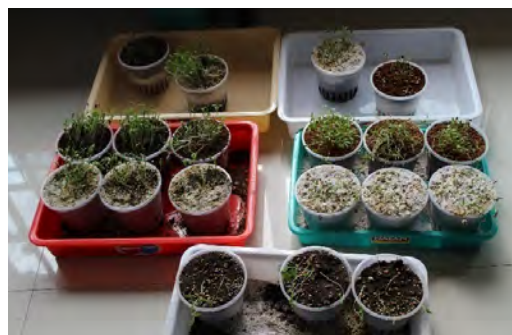
Fig. 2. Experimental Setup

For construction of the experimental setup, 5 trays have taken. The pots are kept in the tray as per the bifuraction. The traysand pots are of good quality plastic. The pots have arrangement for aeration at bottom.Total 13 pots are filled with various combinations of coco peat, perlite and soil. The details are shown in the table. Cocopeat is a crushed coconut coir. The coir is crushed and dried. Later it is compacted and packed in plastic. Cocopeat is selected as alternative to soil as coconut coir has a good moisture holding capacity.