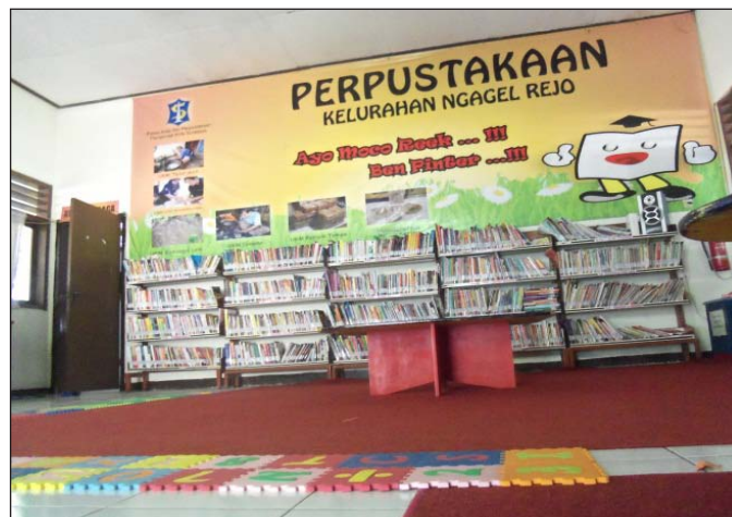
Fig. 2: Inside a TBM

According to the discussion above, the advantages and opprotunities in developing TBM as a knowledge centre are the accessibilities becuase the strengths and opportunities overcome the weaknesses and threats. This is a good chance for Surabaya City Library to take the benefits from the TBMs that they have build utilisation and transformation for the TBMs function not only to serve reading and lending books, but also as a place where users can gain information about local content.