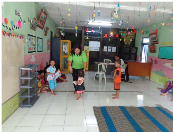
Fig. 4: Activity in TBM