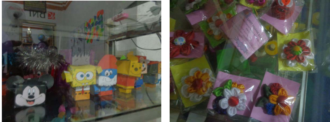
Fig. 3: Handy crafts made by the children in TBM