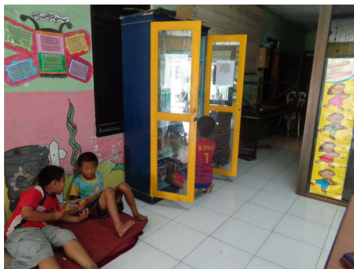
Fig.5: Reading activity in TBM