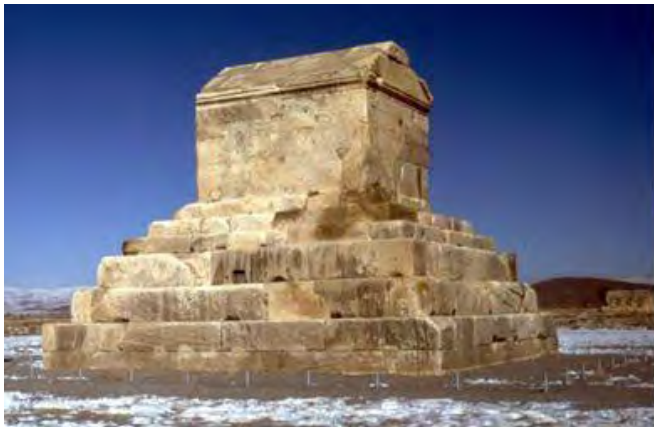
Fig. 2: Mausoleum of cyrus, the oldest base-isolated structure in the world