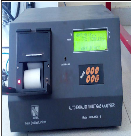
Fig. 2: Multi Gas Analyzer

load. Speed can also be changed accordingly.