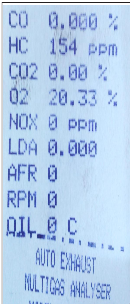
Fig. 3: Sample Reading from Multi Gas Analyzer