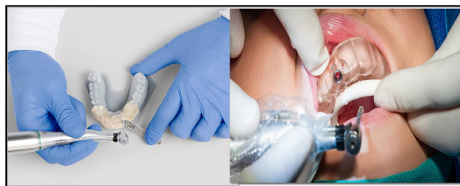
Fig. 1: Surgical Stent for Dental Implant Placement Manufactured using SLA

Guideline of making solid articles includes progressive printing of thin layers of UV treatable photopolymer layer by layer. It is utilized to make implant surgical guides as a result of high strength, obturators, surgical stents, duplication of prosthesis and burn stents [6]. Stereo lithography has been utilized as a part of the field of maxillo facial prosthodontics as obturators, surgical stents, duplication of prosthesis and consume stents. A soft tissue model is built from CT scan into which a silicone is poured for the obturator. The obturator can fit precisely on the patient requiring less alterations contrasted with the customary impression systems (Fig. 1) [7].