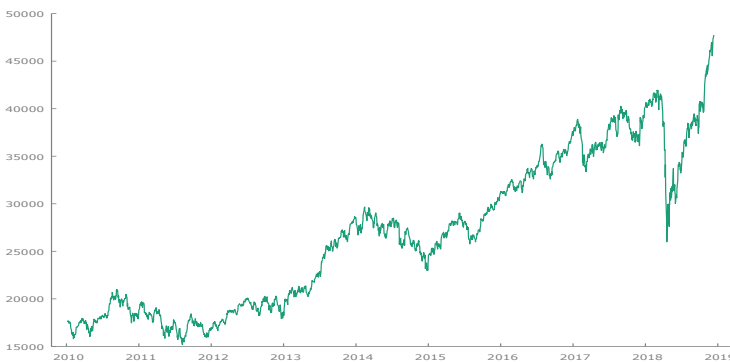
Chart 1- Sensex